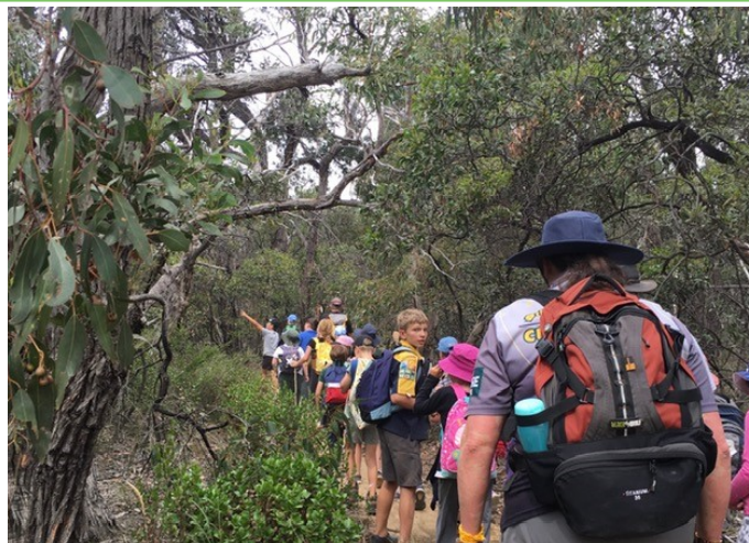
Dereel-Enfield Cubs on a recent camp in Eumerella Scout Camp.

Phone: Claire Kent 0410 768 803 email: ClaireKentdesg@gmail.com