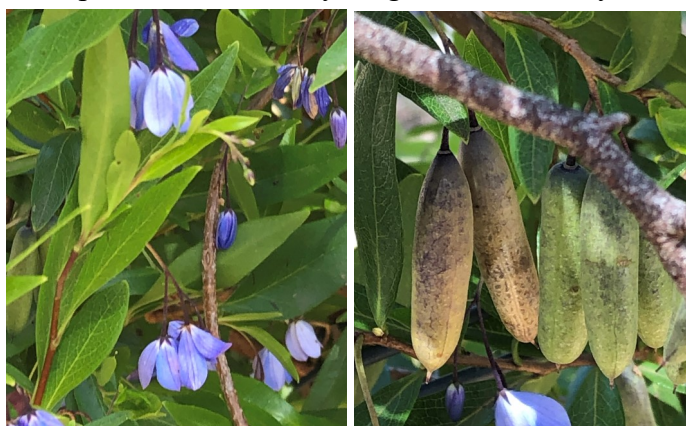
Above, Creeping Bluebell showing flowers (left) and seed pods (right).

Creeping Bluebell has blue flowers and pendulous seed pods, and extremely long invasive root system.