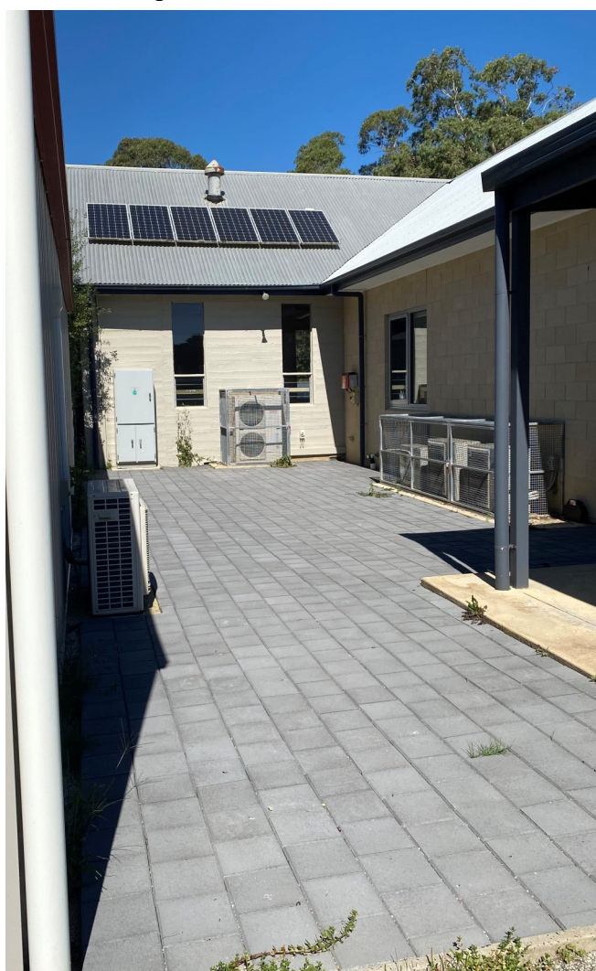
Paving completed! Thanks to an application for the Golden Plains Shire Community Grant by the Dereel Community Hub, and the work of the Men's Shed.

Thank you to everyone involved in completing this project. The next round of Community Planning could provide an opportunity for some furniture and plants in this space.