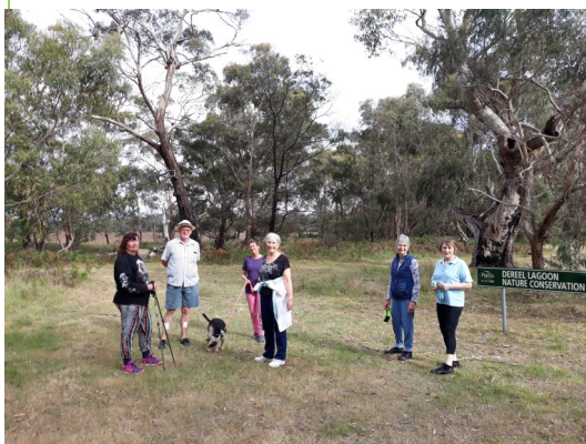
Above: The Dereel Walking Group in 2019 Right: Orchid leaf emerging through bracken