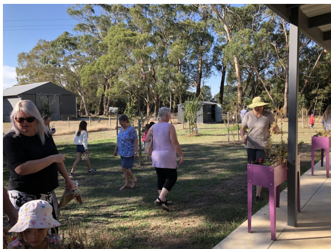
The Dereel Community Garden was an excellent setting for the Easter Egg Hunt in April 2019.

"Our gardens will not just be a place for growing plants and food, but a place to grow as a community. To grow our skills and share them with each other and the younger people of our community. A place where we can become sustainable as a community and grow and share our own local produce. A place where we can move forward together."