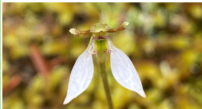
Above: Parsons Bands Orchid. Below left, Tiny Greenhood, Below right, Mosquito Orchid

The Parson's Bands Orchids are approximately 5 cm high, with two prominent white lower petals.