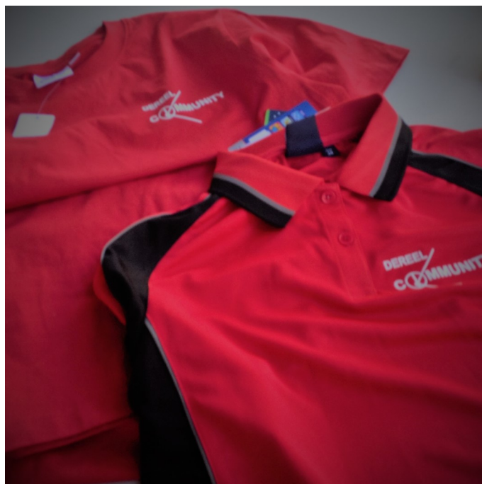
'Dereel Community' T-shirt and Polo shirt. Currently available in red, or order one in your favourite colour.

If you would like to purchase a T-shirt or polo shirt, contact Lorraine on 53420492.