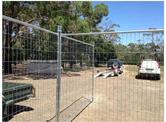
Stands can be linked together at the top for both layout flexibility and stability.