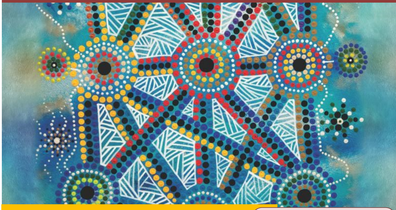
Caption: Songlines Tie All Aboriginal People Together by Lani Balzan