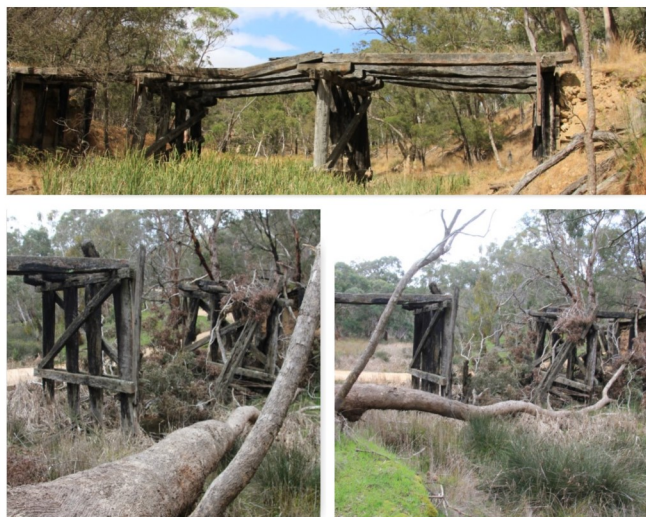
Before and after. The historic Misery Creek Bridge was hit by a falling tree.